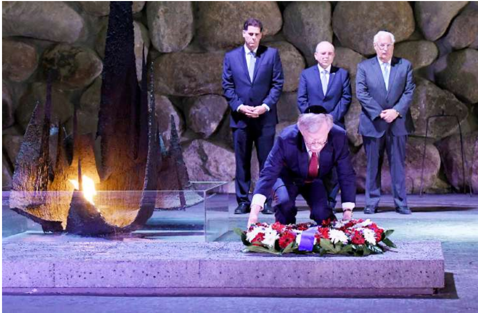
Laying a wreath at the Yad Vashem Holocaust memorial in Jerusalem, Israel, on August 21, 2018, a traditional stop for high-level visitors.