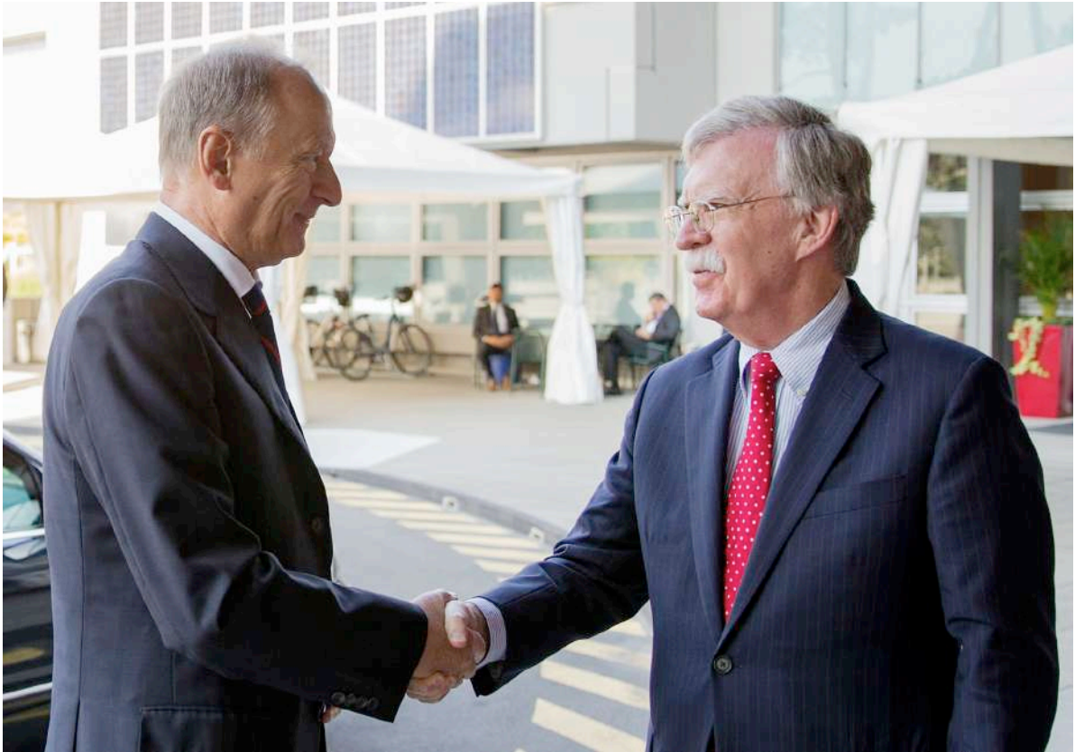
I met Nicolas Patrushev, my Russian counterpart, for the first time, at the US mission in Geneva on August 23, 2018, and made a point of addressing Russian election interference.