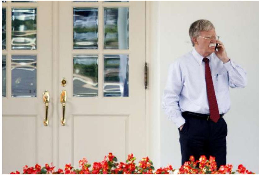
Outside the West Wing on September 10, 2019, explaining to my daughter on my personal cell (normally kept in a secure box during the work day) that I am about to resign.