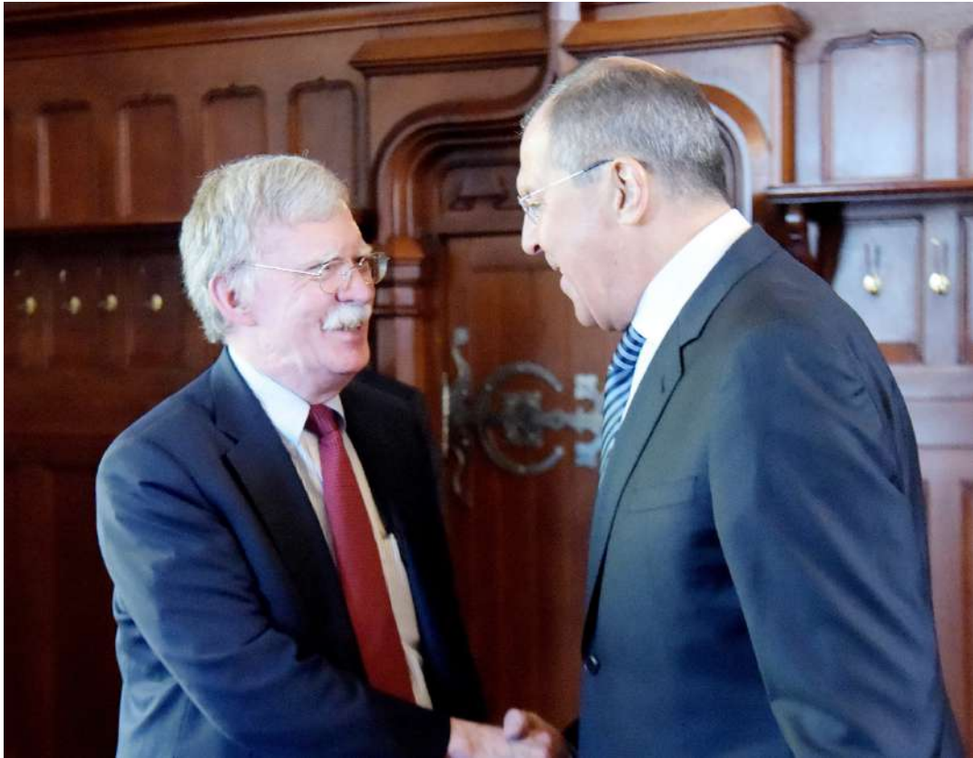
Getting together with Russian Foreign Minister Sergei Lavrov for lunch at Osobnyak House in Moscow on June 27, 2018, to prepare for the Trump-Putin meeting in Helsinki. Unfortunately, the summit ended in disarray when Trump appeared to cast doubt on US intelligence about Russian interference in our elections.