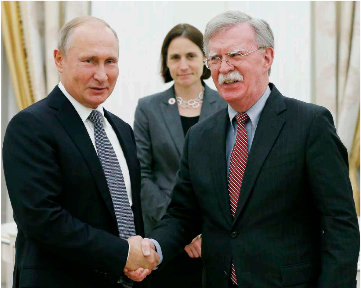
Russian President Vladimir Putin welcomes me to our second 2018 meeting in Moscow's Kremlin, on October 23, where, among other things, Putin joked that Russia would sell weapons to Saudi Arabia if the US did not. Fiona Hill, NSC Senior Director for Europe and Russia, looks on.