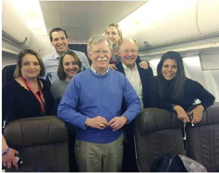
Always an experience: reporters accompanying me on one of several Middle East trips on board our military aircraft, March 23, 2019.