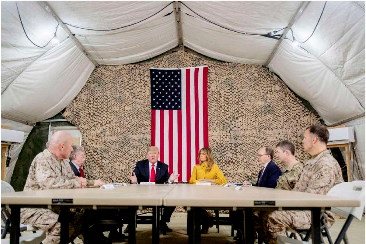
One of the turning points in Trump's decision making on Syria: being briefed by American military commanders at the Al-Asad air base in Iraq, December 26, 2018.