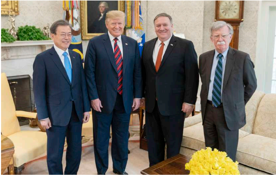
Trump's meeting with South Korean President Moon Jae-in, April 11, 2019, considered what to do next about North Korea's nuclear weapons and ballistic missile programs after two failed summits with Kim Jong-un.