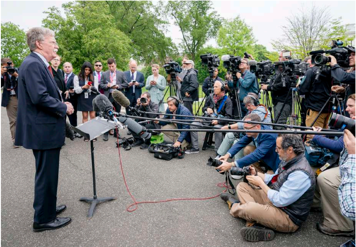
After a sad day for the people of Venezuela, I explained to the press outside the West Wing on May 1, 2019, how close the opposition to the Maduro regime had had come to ousting him.