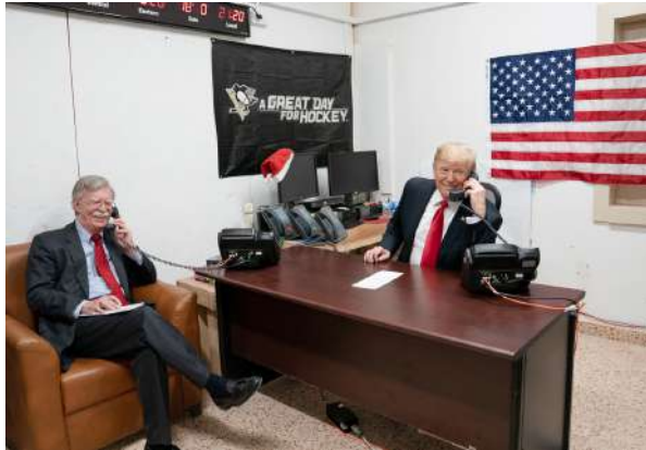
Trump speaks by phone with Iraqi Prime Minister Adil Abdul-Mahdi from Al-Asad air base in Iraq on December 26, 2018, after Abdul-Mahdi decided not to meet with Trump at the base.