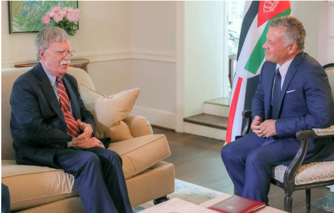
I met with King Abdullah at the residence of Jordan's Ambassador to Washington on June 22, 2018, just before the King's meeting with Trump to discuss the continuing crisis in Syria, and Iran's support for the Assad regime.