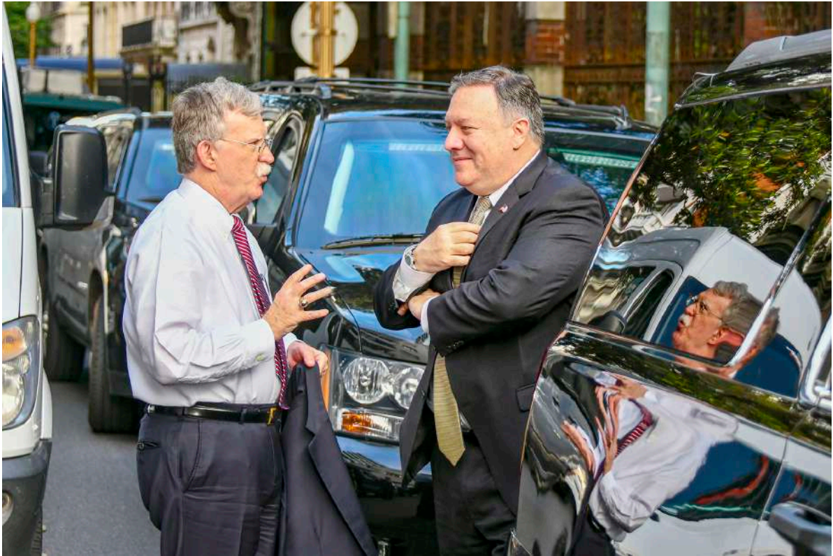
Pompeo and I speak while waiting for Trump, typically late, to join the G20 meetings in Buenos Aires, Argentina, on November 30, 2018, as relations with Russia chilled after the seizure of Ukrainian ships in the Kerch Strait.