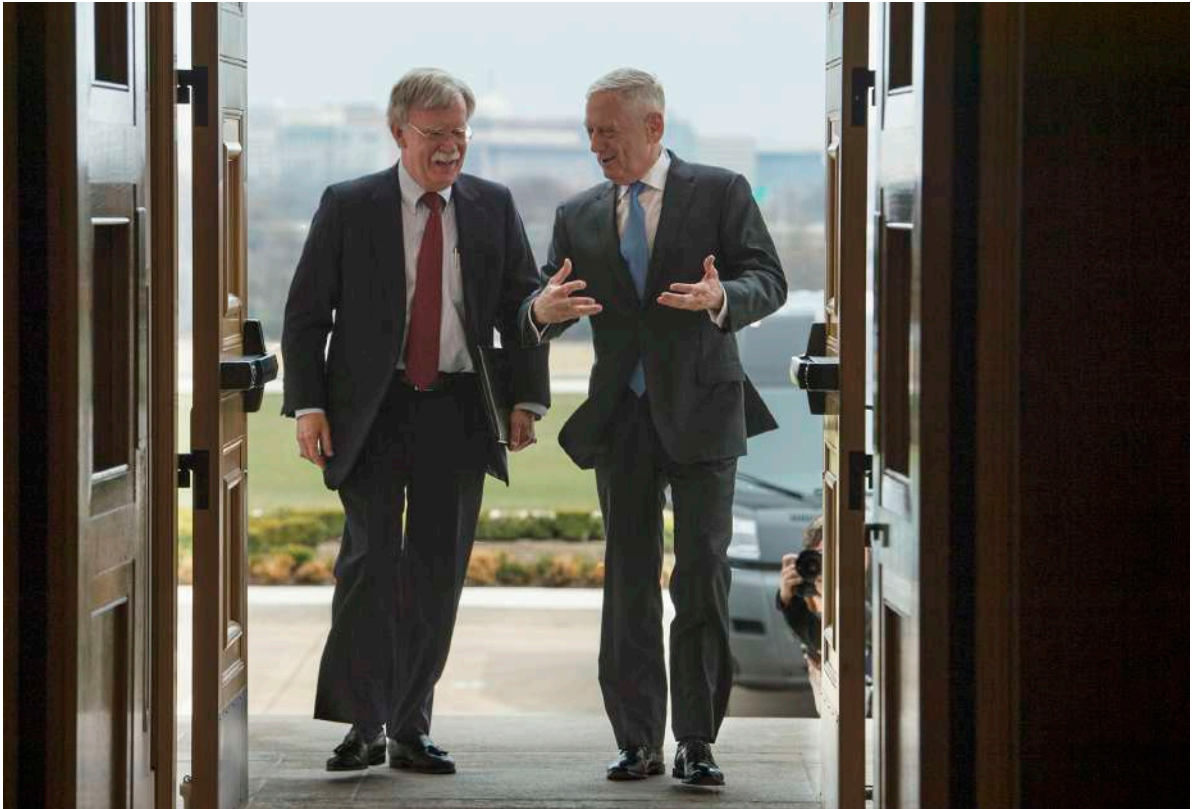
After greeting me at the Pentagon's ceremonial entrance, Mattis and I enter the building for our first meeting, on March 29, 2018, ten days before my official start as National Security Advisor.