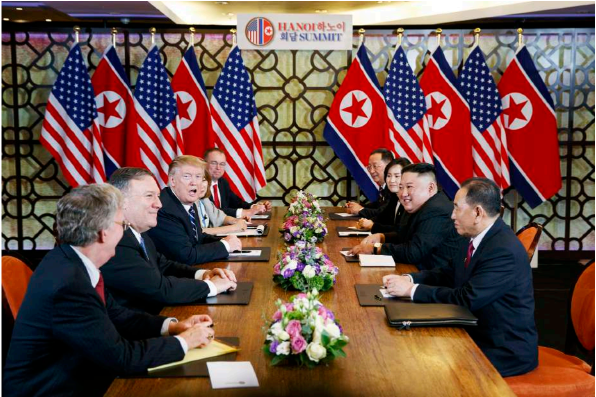
The final meeting of the Hanoi Summit between the United States and North Korea, February 28, 2019, from which Trump walked away without a deal.