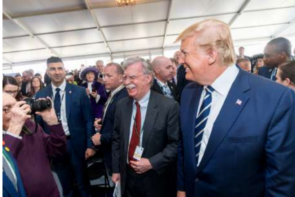
Trump meets with US service members, veterans, and their families at the UK celebration of the 75th anniversary of launching D-Day, on June 5, 2019, at Portsmouth, England, from which much of the Allied invasion armada sailed.